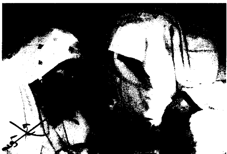
Photograph of H.H. Pope Shenouda III with his disciple Metropolitan Bishoy of Damiette and Barary at the papal Residence of St. Bishoy's Monastery on 31/12/1984

Being cautious about sound education in the church, devoid of untrue and destructive embellishments, I found it my duty to respond to this message using all the synodal and historical proofs which clarify the unsoundness of applying the abovementioned excommunication of the synod of 1873 to the present situation in our church. This excommunication was built upon lack of knowledge of the exact text of Canon 14 of the Apostolic Canons. Moreover, it was issued under special circumstances that do not apply to other generations. Furthermore, the holy synod of 1928 ruled contrary to the decision of the 1873 synod. We shall also clarify how to understand canon 15 of the Nicene Canons in light of canon 14 of the Apostolic Canons. We shall also present the opinion of the teacher of generations H.H. Pope Shenouda III in his own handwriting regarding this subject.